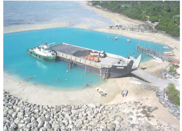
“Arjuna/Colossus Tug/Barge at Warraber Is

The bow door has a greater width to allow for specific cargo handling, providing enhanced access for machinery on and off the vessel's deck during continuous bulk material loading operations.